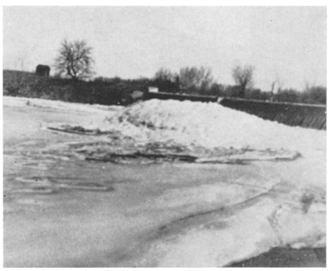
Fig. 1. Foaming incident on the Blue River, Neb. in early 1920's.